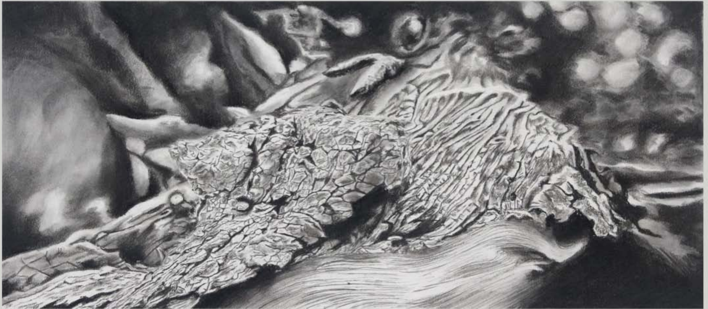
Laurette de Jager, All of Creation II (2022). Charcoal on Canson Montval Aquarelle 300gsm, 49cm x 104cm. Framed in Kiaat. R 10 500