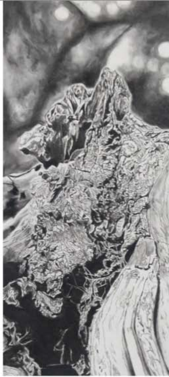
Laurette de Jager, C'est le monde II (2022). Charcoal on Canson Montval Aquarelle 300gsm, 49cm x 104cm. Framed in Kiaat. R10 500