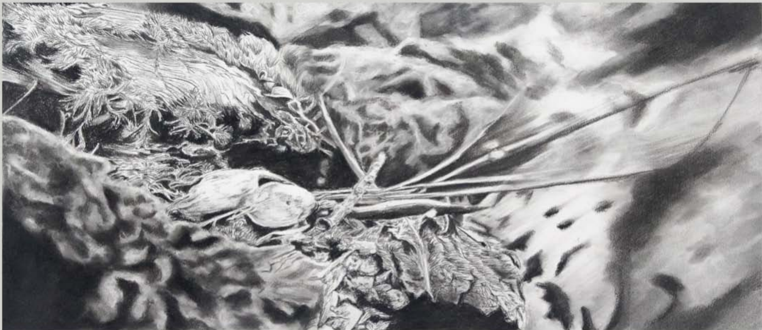
Laurette de Jager, Ceci n'est pas une métaphore | This is not a metaphor II (2022). Charcoal on Canson Montval Aquarelle 300gsm, 49cm x 104cm. Framed in Kiaat. R 10 500