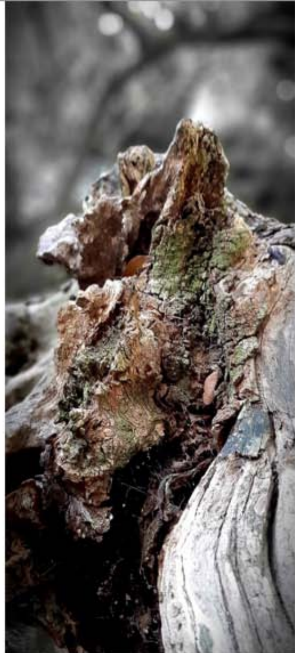
Laurette de Jager, C'est le monde I (2022). Digital Photomontage, on Felix Schoeller True Fibre 200gsm, 49cm x 104cm. Framed in Kiaat. R8 500