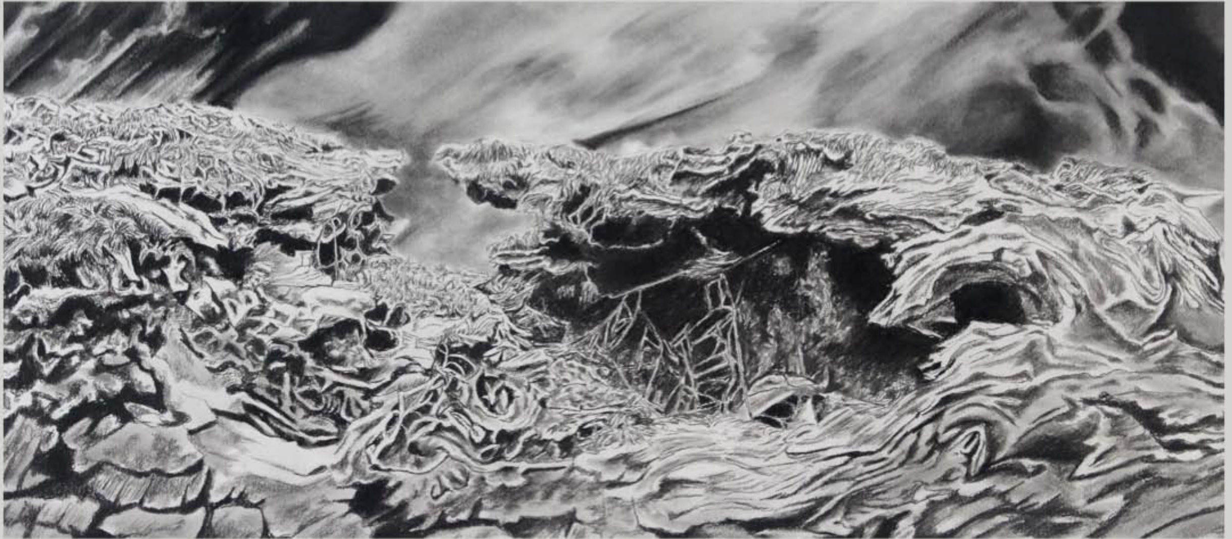
Laurette de Jager, Microcosm II (2022). Charcoal on Canson Montval Aquarelle 300gsm, 49cm x 104cm. Framed in Kiaat. R 10 500