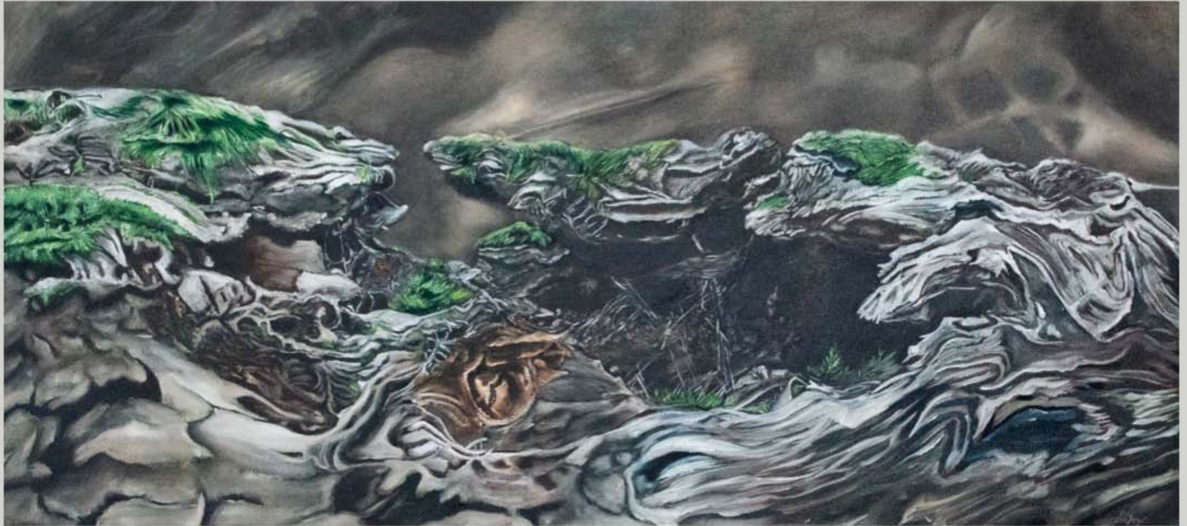
Laurette de Jager, Microcosm III (2022). Oil on canvas, 49cm x 104cm. Framed in Kiaat. R 16 000