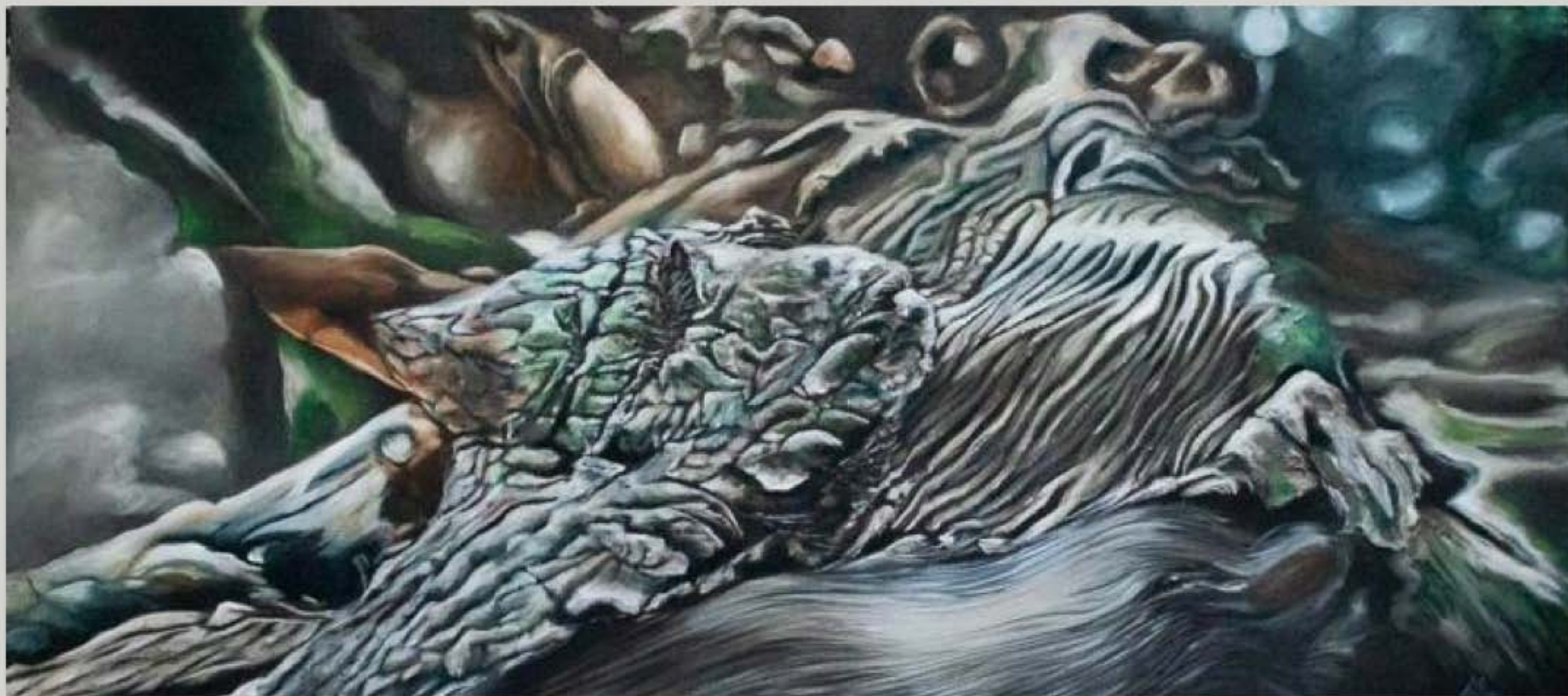
Laurette de Jager, All of Creation III (2022). Oil on canvas, 49cm x 104cm. Framed in Kiaat. R 16 000