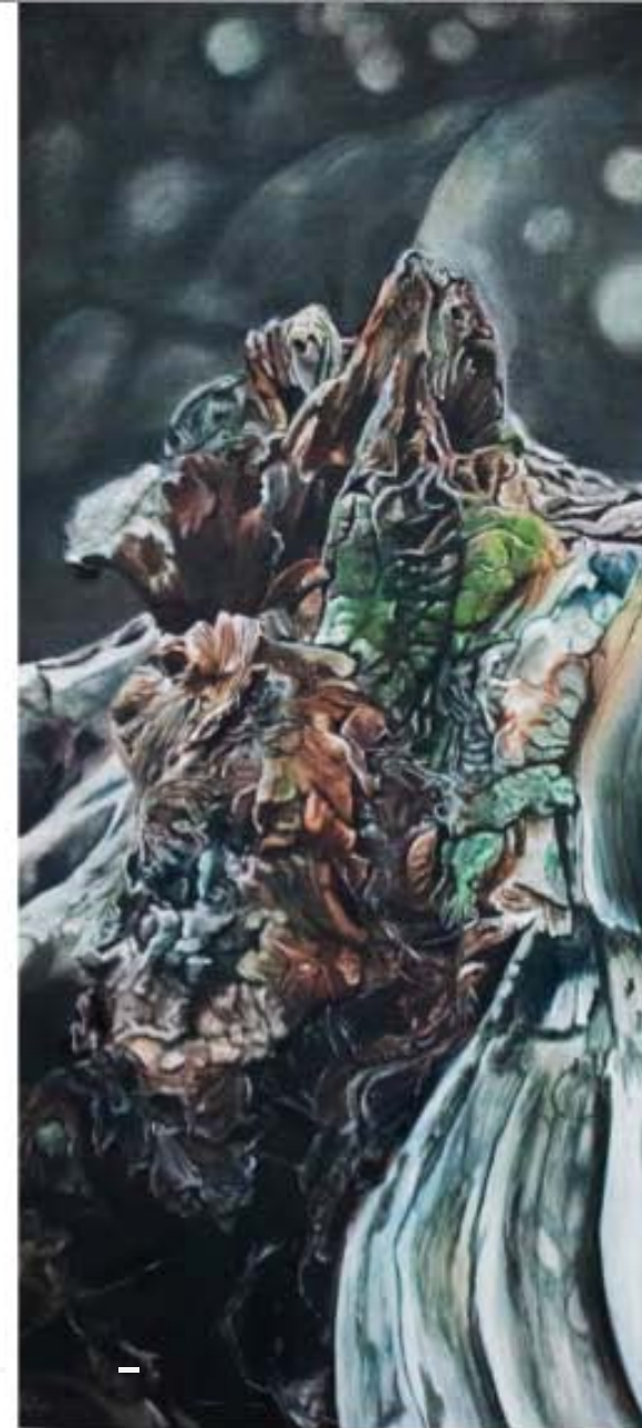
Laurette de Jager, C'est le monde III (2022). Oil on canvas, 49cm x 104cm. Framed in Kiaat. R16 000